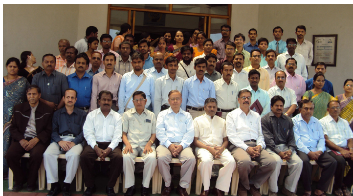
Participants of Khanij 2010 with resource persons.