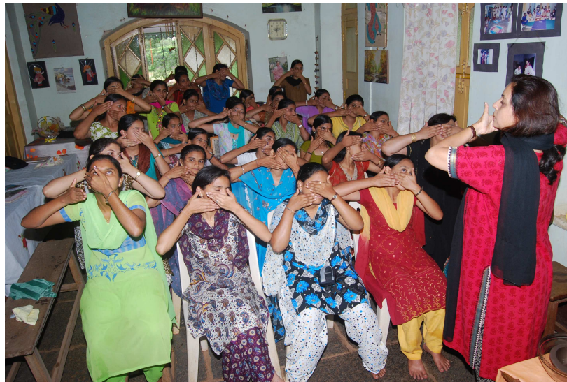
Hobby Centre: Personal Grooming Course