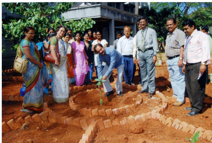
Plantation in Nakshatra Garden by alumni association