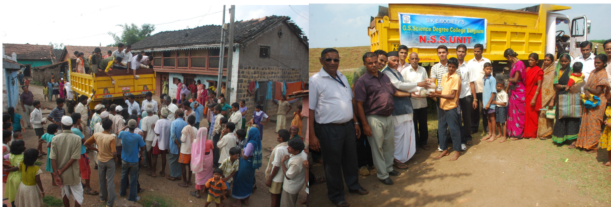
Flood relief distribution to villagers of Kamatnoor by NSS unit.