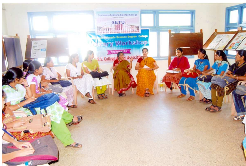
Students of SETU, at the workshop

The College Library conducted a Ten-day Workshop for students on ‘Using Library Resources Effectively’ from 31 August to 9 September, 2009.