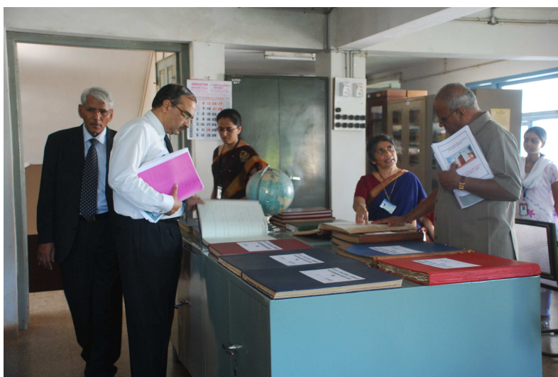
NAAC Peer Committee, evaluating the library during the Reaccreditation process.

The IQAC held extensive discussions and worked out the below-detailed plan of action to promote, enhance and monitor the quality of the teaching-learning process and the pursuit of excellence. The planned measures are under three heads: